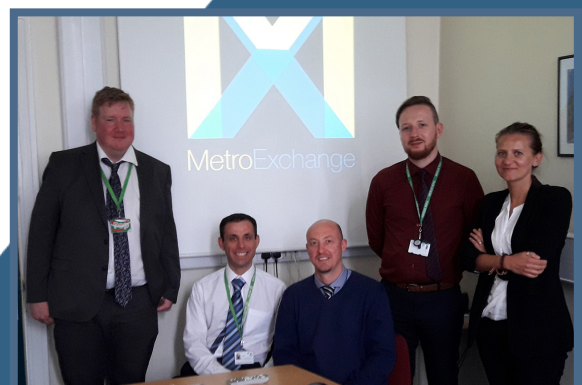
Right: Nexus, NU and MU team at Newcastle University office in Newcastle, UK