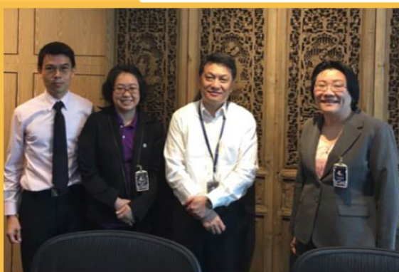
Left: BTS and MU team at BTS office in Bangkok, Thailand